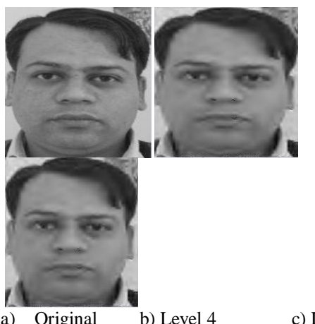
a) Original b) Level 4 c) Level 6 Fig. 3: Embedded Zerotree