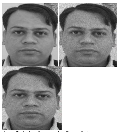
a) Original b) Level 4 c) Level 7 Fig. 2: Wavelet Compression