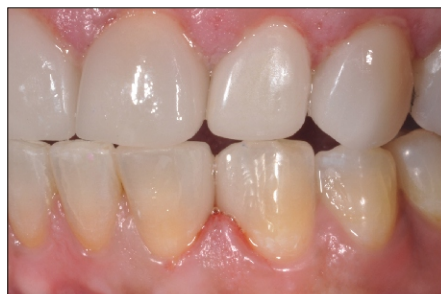
Fig.9 The function of the veneers was checked immediately after seating. The gingiva was still slightly traumatized at this point.