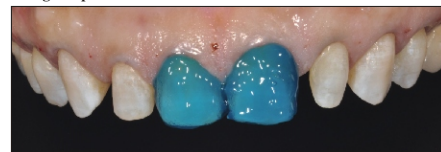
Fig.7 Adhesive luting of the veneers using solvent-free Heliobond enamel adhesive ...