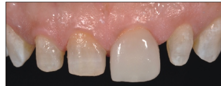
Fig.6 Dry try-in of the veneers to determine the shade of the luting composite.

In the case at hand, the luting composite provided assistance. The value concept of Variolink® Veneer enables the clinician to make slight adjustments to the shade of the restoration. The “High Value” shades allow the shade to be lightened gradually, while with the “Low Value” shades, the overlying all-ceramic material can be made darker in stages. For permanent cementation, a solvent-free bonding agent (Heliobond for enamel bonding) and a light-curing luting composite (Variolink Veneer Value +1) were used (Figs 6 to 9).