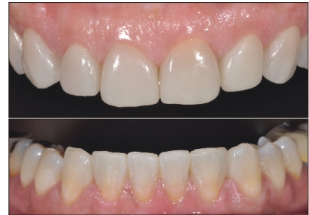
Figs 10 & 11 View one week after the placement of the veneers. The mandibular teeth were subjected to a one-time bleaching process.