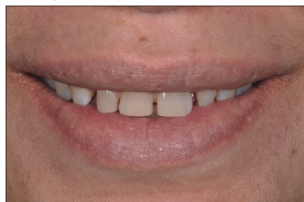
Fig.1 Preoperative Situation: Multiple distemas are present. The patient's wish was to have them closed.

Because of their superior esthetic and mechanical properties, indirect veneers are ideal when extensive esthetic adjustments are required. Before the material is chosen, the clinician needs to understand the two main challenges of esthetic oral rehabilitation: selecting the proper shade and opacity of the material and determining the amount of tooth structure that needs to be removed in order to achieve the desired result. For example, in cases where teeth are moderately to severely misaligned and orthodontic treatment is not possible, aggressive preparation will be needed. The same applies to teeth with heavy staining caused by fluorosis or tetracycline.