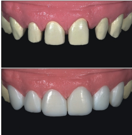
Figs. 2a & b The wax-up on the model with the gingival mask in place gives an idea of how the situation can be improved.

clinic, teeth 11 to 21 had been restored distally with composite fillings.