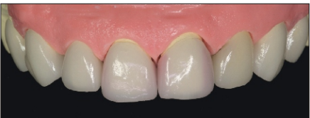
Fig.4 Full-contour veneers were pressed using highly translucent IPS e.max Press lithium disilicate material (layer thickness 200 to 300 µm).

Diastemas between the laterals and canines were present on both sides.