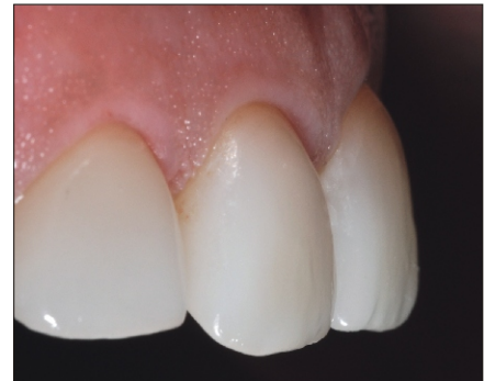
Fig.12 After four weeks, the gingiva had healed completely.