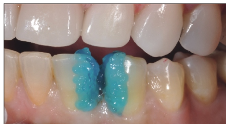
Fig.8 ...in combination with Variolink Veneer, a purely light-curing luting composite