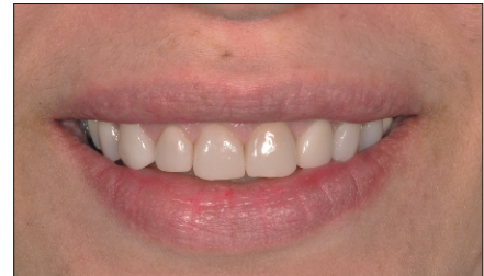
Fig.13 Final result after two months