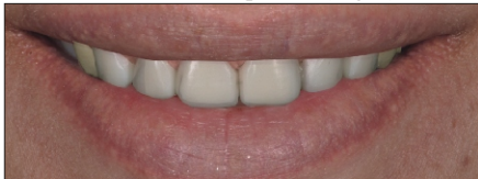
Fig.3 A digital picture of the wax-up was superimposed onto the picture of the preoperative situation. In this way, a digital mock-up was created.

In our practice, the old composite fillings were removed. In non-prep veneer cases, it is essential for the dental technician to have exact knowledge of the sulcus depth. Therefore, two retractions cords were placed: triple 0 (Ultrapak, Ultradent), which remained in place during impression taking, and 0, which retracted her gingiva and was removed before the impression was finalized. A wax-up was fabricated (Figs 2a and b), digitized and superimposed onto the clinical picture to create a digital mock-up, which was then discussed with the patient (Fig. 3).