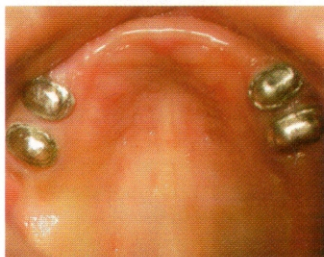
Fig. 5 : Finished coping after insertion