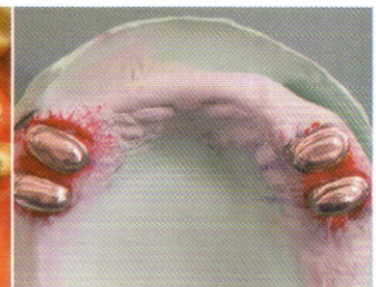
Fig. 4 : Master cast