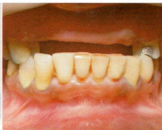
Fig. 2 : Intra oral view