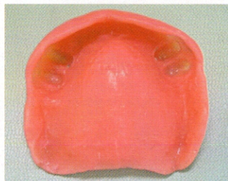
Fig. 6 : Over denture prosthesis