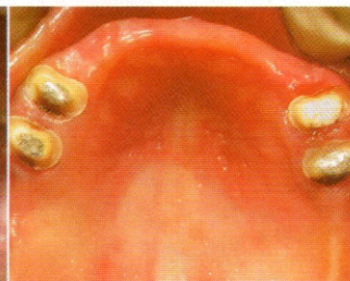
Fig. 3 : Abutments preparation