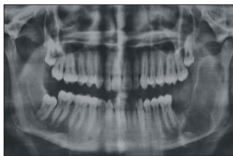
Fig. 1: OPG showing radiolucency on the left side of

the mandible extending from 36 upto the angle with involvement of the whole ramus.