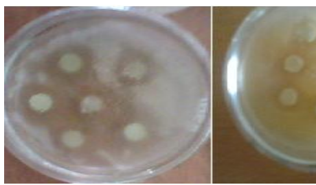
Fig.2: E. maculata against S.aureus