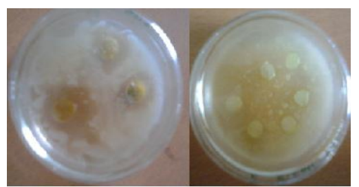
Fig.6:M.koenigii against S.aureus