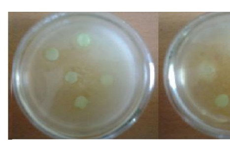
Fig.8: T.procumbens against E. coli.