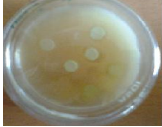
Fig. 11. O.americanum against E. coli