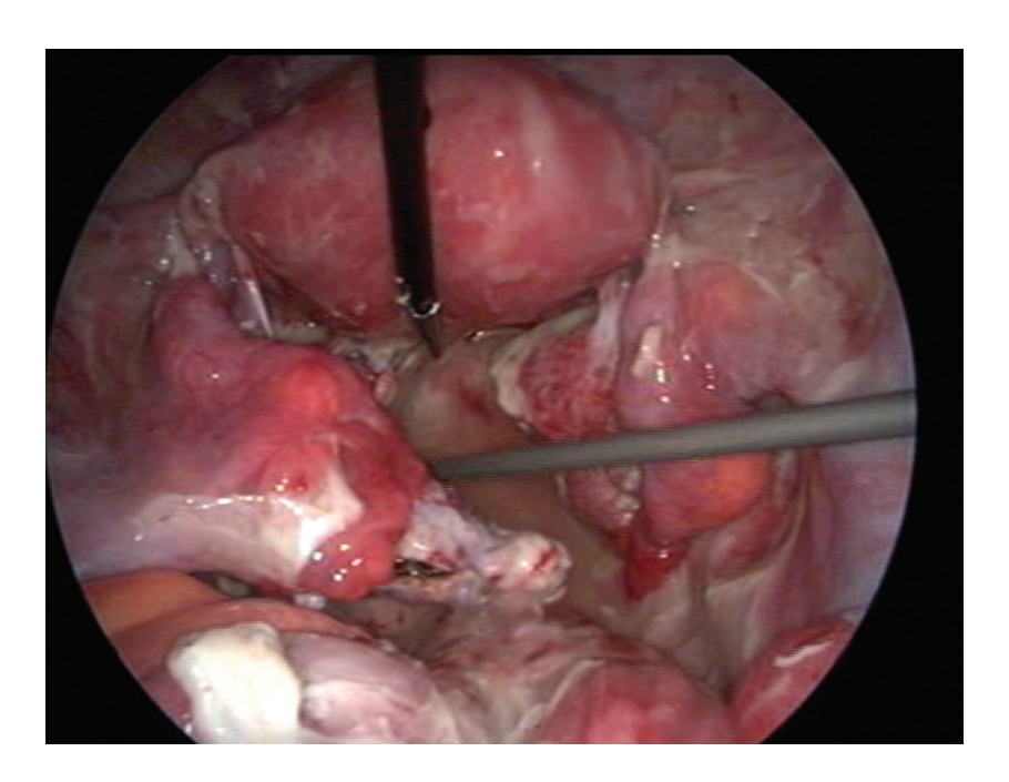
Fig 3: Appearance after excision of the mass and irrigation of the pelvis.