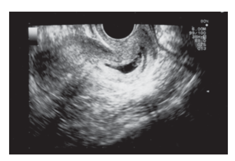
Fig 1: Sagittal endovaginal ultrasound of a cervical EP.