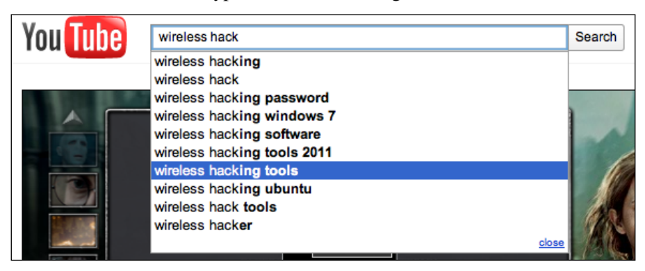
Figure 11: Choosing a suggested search term in YouTube

In this example the search term executed was 'wireless hacking tools'. The following part of the URL, '&aq=6', indicates which search term was selected from the drop down menu. In this case it was the seventh suggestion as numbering starts from zero. This can be seen in Figure 11. The final part of this URL, '&oq=wireless+hack', indicates how much of the search term was physically typed in by the user before selecting the suggested search term. In this case 'wireless hack' was typed, also shown in Figure 11.