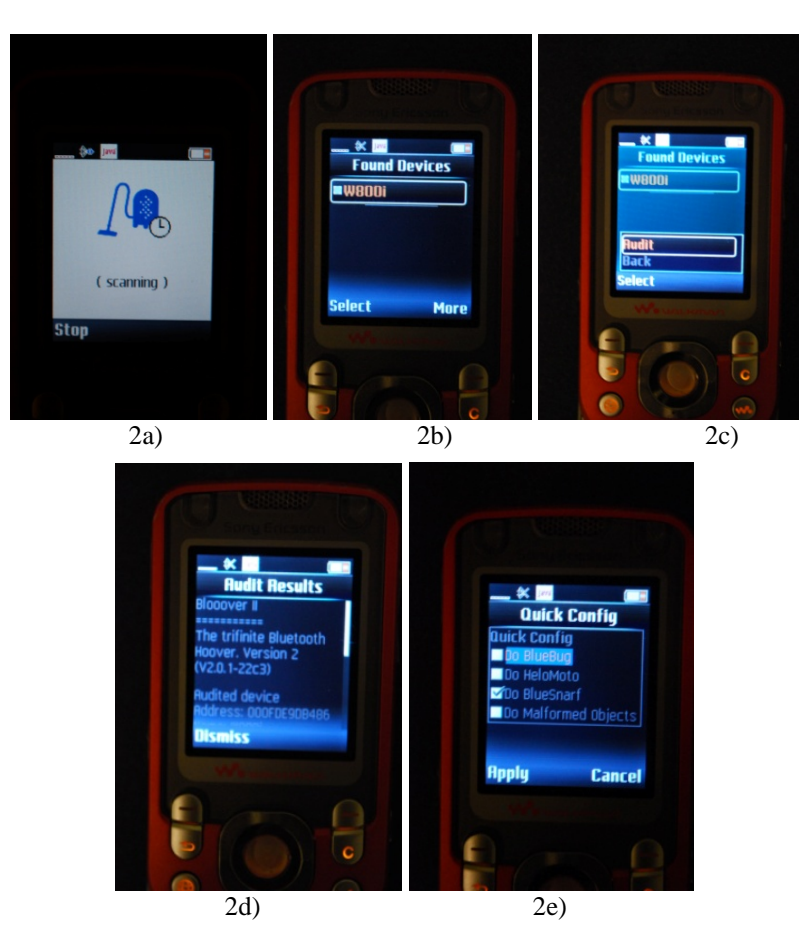
Figure 2. Bloover II screen shots.

Figure 2 shows a series of screen shots using Bloover II from a W550i phone to access a W800i phone. Figure 2a shows the attacker's phone scanning for another Bluetooth phone; in Figure 2b, a device named W800i is found. The audit feature of Bloover is initiated (Figure 2c) and results (Figure 2d) include the target device's address, communications channel for communication with the headset and other functional profiles, the RFCOMM channel, and phone contact information. A specific attack type (Bluebug in this case) is selected from the Quick Config menu (Figure 2d).