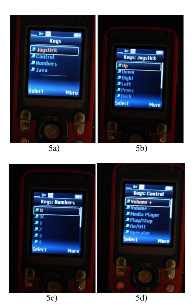
Figure 5. BT Info screen shots (Keys functions).

The Calling menu (Figure 4d) offers four options, allowing the attacker to dial any number, hang up a call, place a current call on hold, or redial the last number. An attacker can use the Calling option, for example, to call a second phone owned by the attacker in order to listen in on the victim's conversations. If the target phone has a speaker function that operates when the phone is closed, the attacker can still be able to establish a call and listen in. From the main Actions menu, the attacker can also change the display language that the phone uses.