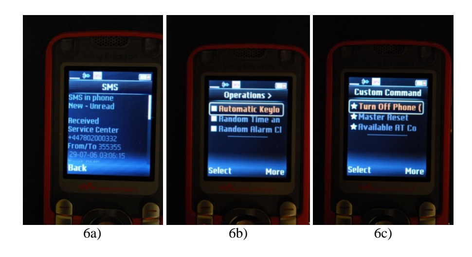
Figure 6. BT Info screen shots (miscellaneous).

The Operations action (Figure 6b) has several options. Automatic Keylock gives an attacker the ability to automatically lock the victim's when it is unlocked; i.e., when the victim unlocks the phone, it will automatically relock itself. The Random Time and Date Change option randomly changes the date and time on the victim's roughly a hundred times per minute. Similarly, the Random Alarm option randomly sets the victim phone's alarm settings.