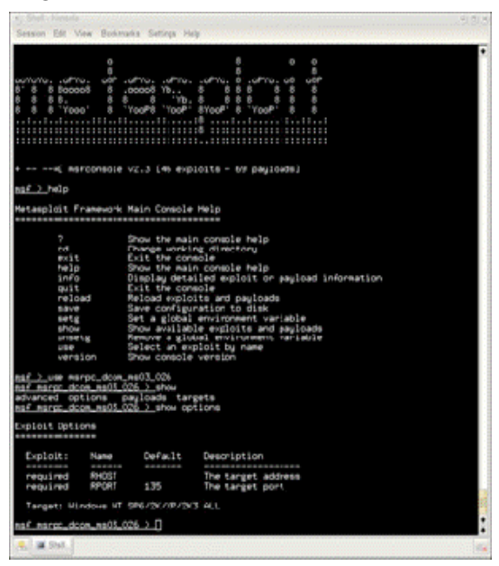
Figure 3. A Metasploit Framework Screenshot

Metasploit Framework. This framework provides a complete workbench for writing, testing, and using exploit code. It is, in fact, a solid platform for penetration testing, shellcode development, and vulnerability assessment. The framework is available for multiple operating systems such as Linux, Windows, BSD, and MacOS X. A screenshot of the metsploit framework at work is shown in Figure 3.