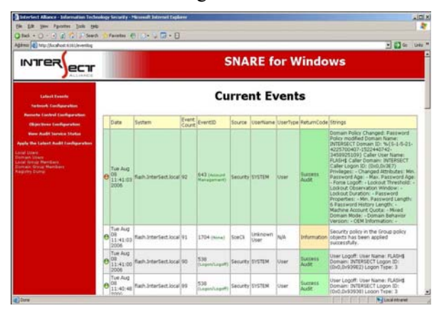
Figure 7. A SNARE Event Window

System iNtrusion Analysis & Reporting Environment (SNARE). This is an open source tool that allows the collection and forwarding of Windows event logs to a remote audit event collection facility, the SNARE microserver (InterSectAlliance, 2006). An enterprise version of the microserver is available as a commercial product which is fully supported by the IntersectAlliance Company. SNARE, which is an Intrusion Detection System (IDS) for Windows, allows system and security administrators full access and remote control of the application through a web browser. The application uses intelligent agents to automate the collection and reporting of log data. The SNARE agent tool is also available for Solaris, AIX, IRIX, Unix, and Fedora Linux operating systems. A SNARE Event Window graphical user interface is shown in Figure 7.