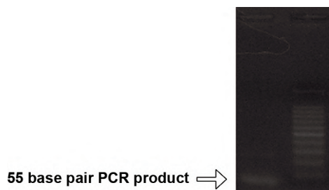
Fig 3: Electrophoresis of the PCR product.