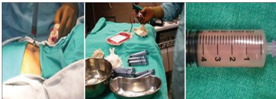
Figure 1: Showing technique of bone marrow aspiration & cell harvesting