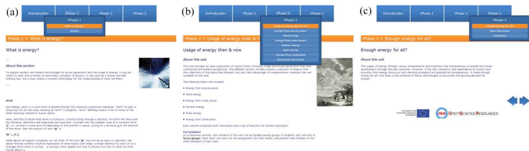
Figure 1: Three units of the educational pathway. (a) Unit 1; (b) Unit 2; (c) Unit 3.