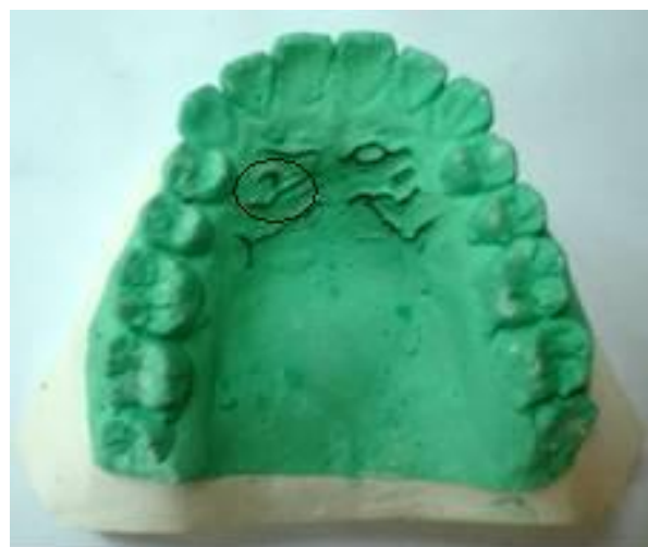
Fig 3: Palatal rugae unification on casts.