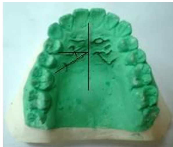
Fig 2: The rugae direction determination on casts.