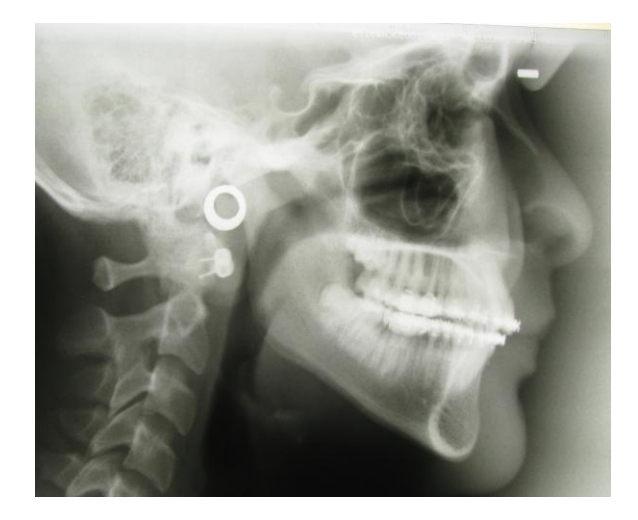
Figure 14: Post-treatment cephalometric radiograph