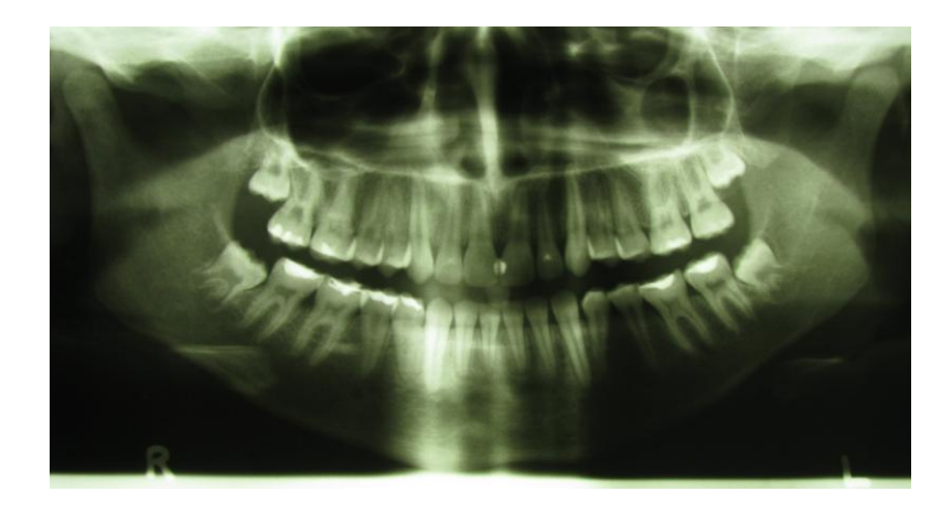
Figure 13: Post-treatment panoramic radiograph