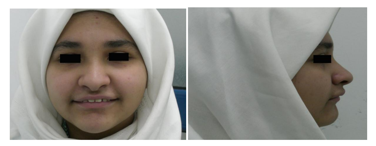
Figure 1,2: Pre-treatment extraoral photographs