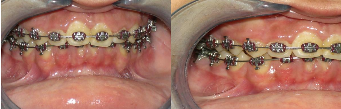
Figures 7,8: Intra-oral views showing rectangular 0.017" x 0.025" stainless steel archwires in place during space closure