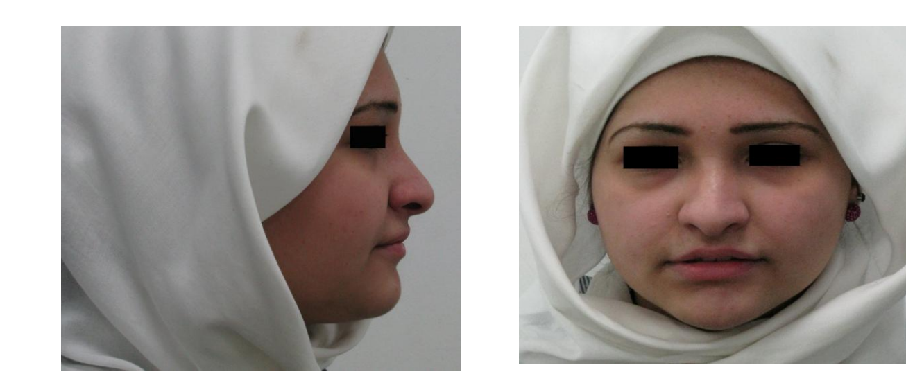
Figures 11,12: Post-treatment extraoral photographs