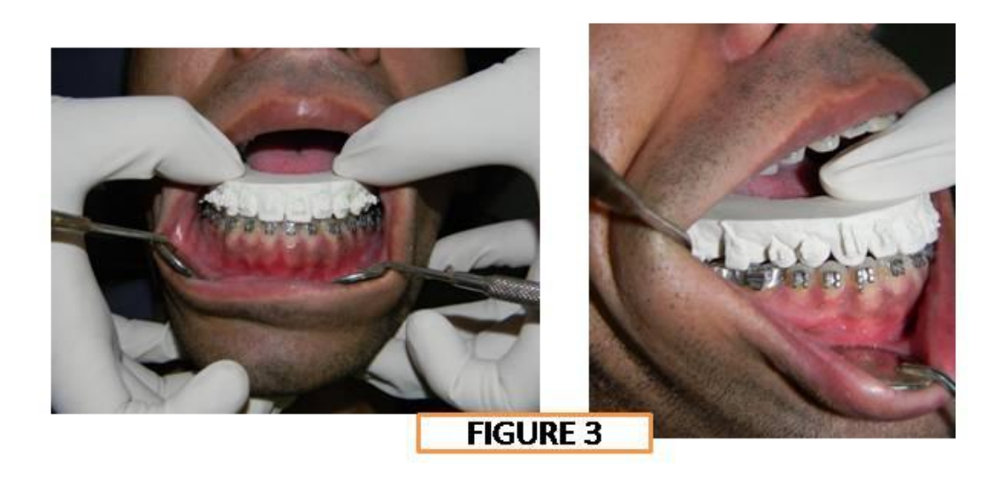
Figure 1: Trimmed model of maxilla and mandible. Figure 2: Indicates the maxillary relation of check model. Figure 3: Shows mandibular relation of check model.