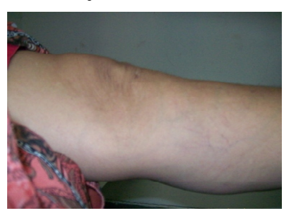
Fig. 3: Extension deficit.

At the end of 3 months post arthroplasty, she presented to our department. On observation diffuse swelling around operated knee and healed mobile scar (Figure 1) were present. Gait observation revealed trunk bending on right side on right stance, decreased left step length and decreased left stance time. Palpation revealed soft swelling with slight elevation of skin temperature around operated knee joint. On Examination, active and passive knee flexion was 70 (Figure 2) and 75 degrees respectively. Manual muscle testing revealed weakness of knee extensors (2/5 with 10 degrees of quadriceps lag, Figure 3), knee flexors (3/5)