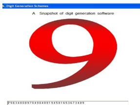
Fig. 1- Snap shot of the GUI developed in vb6. The Nineteen Electrodes

For the EEG data, experiments were conducted in which subjects were shown visual stimuli consisting of the Random Number Generator. Graphics User Interface was developed in VB7 .The GUI was shown for one minute and then there was a gap for certain time interval, wherein subjects were asked to take rest with eyes closed. A single experimental session typically comprised of 4 trials of complete display of GUI from 0 to 9. The record of the displayed number was maintained for reference during analysis and pattern matching. Figure 1 shows the snap shot of the GUI.