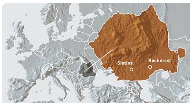
Fig. 1 The geographical position of Slatina in Romania (processed www.google.com )

City Slatina municipality in the southern part of Romania, mathematical coordinates 44 ° 26 ' 33 " north latitude and 24 ° 1' 57 " east longitude (figure 1), being positioned on left bank of Olt river in contact two major units relief Romanian Plain and Getic Plateau. The boundary between these units passing north of the town.