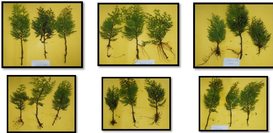
Plate 1: Root formation in Thuja compecta with IBA treatments.

similar to Panwar et al. (8) in Bougainvillea cv. Alok with respect to length of roots per cutting.