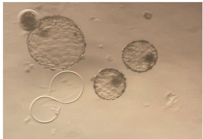
Fig. 1. In vitro bovine hatching blastocyst.

The cleavage rates were checked on Day 2, the blastocyst rates were checked on Day 7, and the hatching blastocyst rates were checked on Day 8 or Day 9 after in vitro fertilization. In vitro bovine hatching blastocysts are shown in Fig. 1.