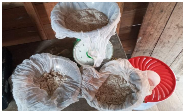
Figure 1. Steaming analog rice dough

conditions after steaming, the dough is put into an extruder. It is performed because it will be challenging to shape it like rice when the dough has cooled down. This process is carried out until the last treatment combination. The finished analog rice is then air-dried to prevent mold growth by reducing the moisture content.