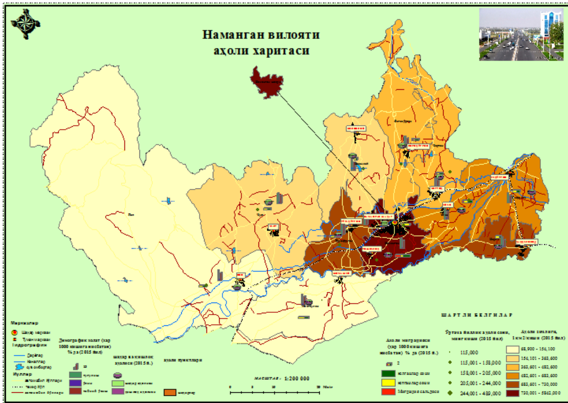
Figure-1. Population map of Namangan region.

It should be noted that the modernity and prospects of geographical cartography are difficult to imagine without Geographic Information Systems. Unfortunately, research in this area is currently insufficient. It is advisable to use modern technical equipment and foreign achievements in mapping research.