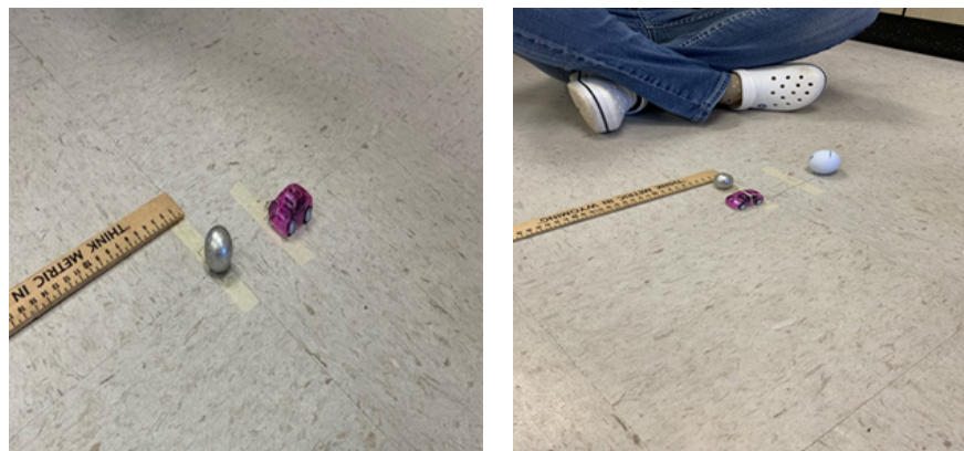
Pull-back Car Being Used to Apply Force to Steel and Golf Balls