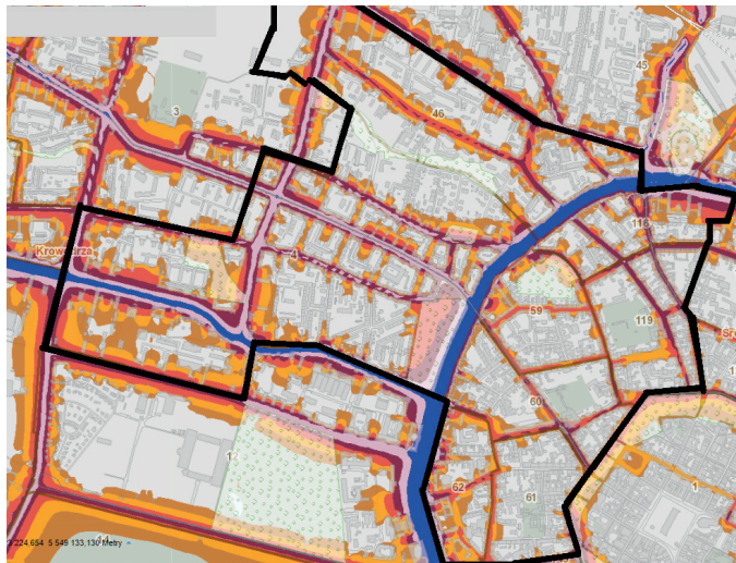
Fig. 1. The map of noise in the analysed area

The work also uses the acoustic map of Krakow, which is one of the instruments for managing the acoustic climate. The distribution of noise level in the analysed area - the L dn indicator (day - evening - night) is presented in the form of Fig.1.