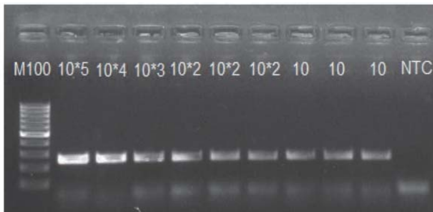
Fig. 3. The results of pTZ57R/T_ASF minimal copy number detection using conventional PCR

pure plasmid DNA. Thus, gene copy number calculation in plasmid DNA sample is more accurate than in one containing DNA of both host organism and pathogen.