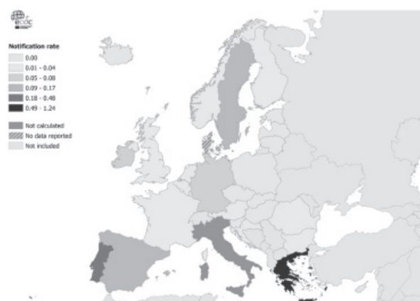
Fig. 1. Reported confirmed brucellosis cases: rate per 100 000 population, EU/EEA, 2014

Because of the potentiality of emergence of new species as human pathogens, brucellosis is a continuously re-emerging zoonotic disease. Brucellosis remains a rare disease in EU/EEA. In 2014, 354 confirmed cases of brucellosis were reported by 18 EU/EEA countries. The highest rates were reported by Greece (135), Spain (60) and Portugal (50), following by Germany (47), France (16), Sweden (16), (ECDC, 2016).