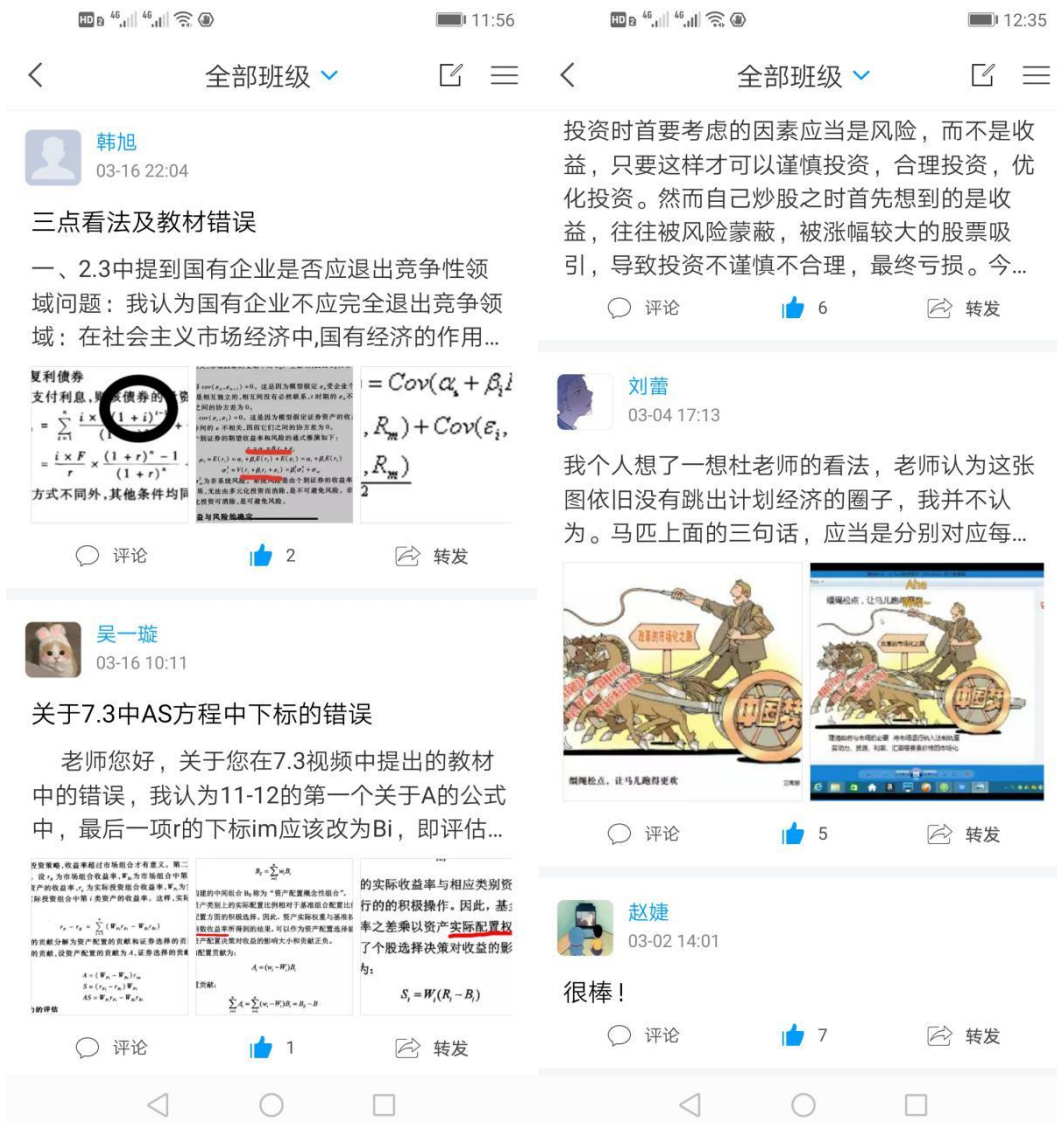
Figure 3: Example 2: screenshots of discussion topics posted by students

Fund: "Research on innovation of evaluation method of university curriculum performance based on professional quality monitoring" (Project No. 2018jyxm0291), Provincial Quality Engineering Teaching Research project of Anhui Province in 2018; Source of funds: Department of education of Anhui