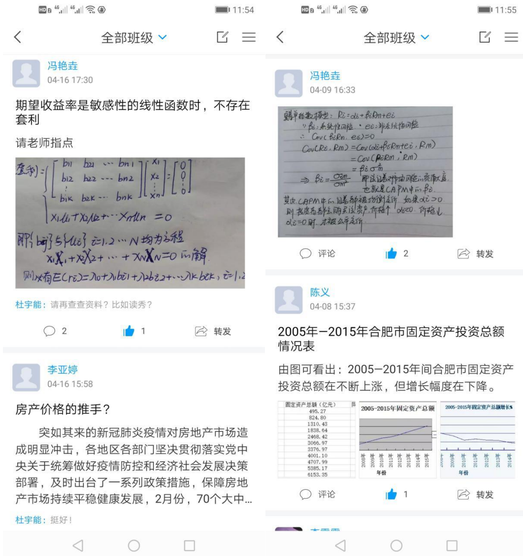
Figure 2: Example 1 of screenshots of discussion topics released by students