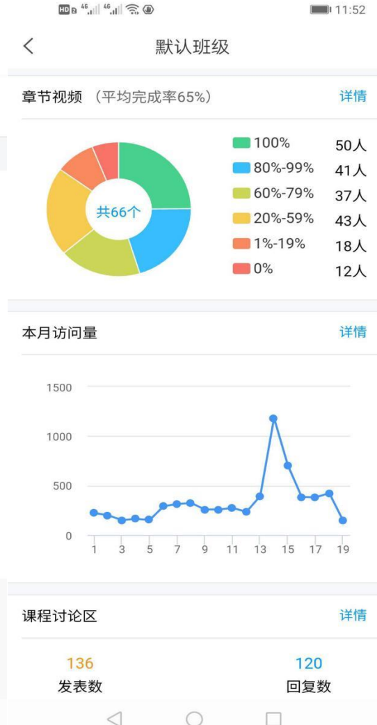
Figure 1: Screenshot of learning statistics (as of the morning of April 19, 2020)