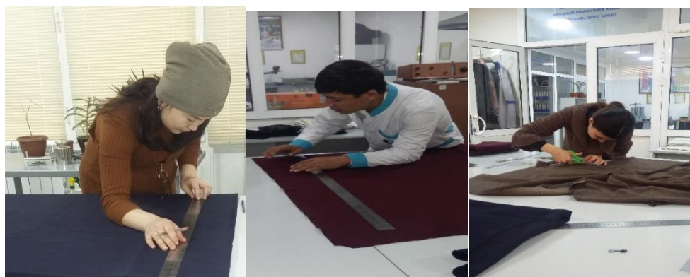
Picture 4. Test laboratory

the influence of force. The solution to this problem is to increase the shape of the fabric by adding lycra yarn to the glad knit fabric. The following is an analysis of the changes in the physical and mechanical properties of the glad fabric when woven from 20-text melange yarn and 100% cotton yarn, as well as cotton yarn with different amounts of lycra yarn. To determine the tear characteristics of the fabric according to the standard, samples were prepared by cutting the length and width of 300x50 mm glknitted fabrics (Figures 4-a, b, c).