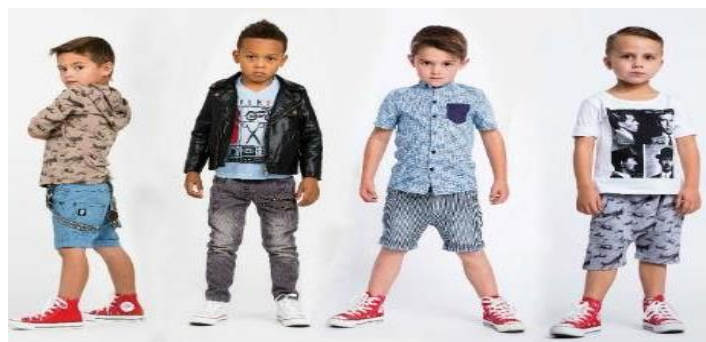
Picture:2. Boys' clothes