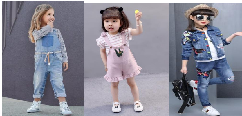
Picture: 1. Girls' clothes

popular options in the children's wardrobe today, and flannel, corduroy, ribbon, and plaid fabrics are the most suitable choices for the age group.