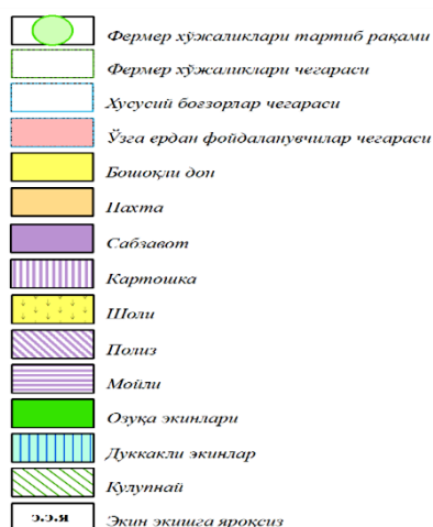
Figure 1. Conventional signs of agricultural crops

After you create layers, each of them will be sorted so that the map is fully reflected and the map has a high readability level. At the same time, I would like to point out the objects (water and oil wells, vineyards, sparse forests, pumps, etc.), lines (lines, lines, etc.) that should be shown on the map using dots, necessary facilities (land user boundaries, dry line boundaries, walls and barriers, roads (excluding highways), pipelines, bridges, canals and collectors, canals, protective trees, dry rivers etc.) and objects which, in turn, should be provided with fields (polygonal, polygon), residential areas and public areas, public buildings, ruins, demolished and semi-demolished structures, field cellars, threshing floors and warehouses, gardens, vineyards, mulberry trees, pastures, irrigated land, sands, cemeteries, non-agricultural lands, etc.) (Figure 1).