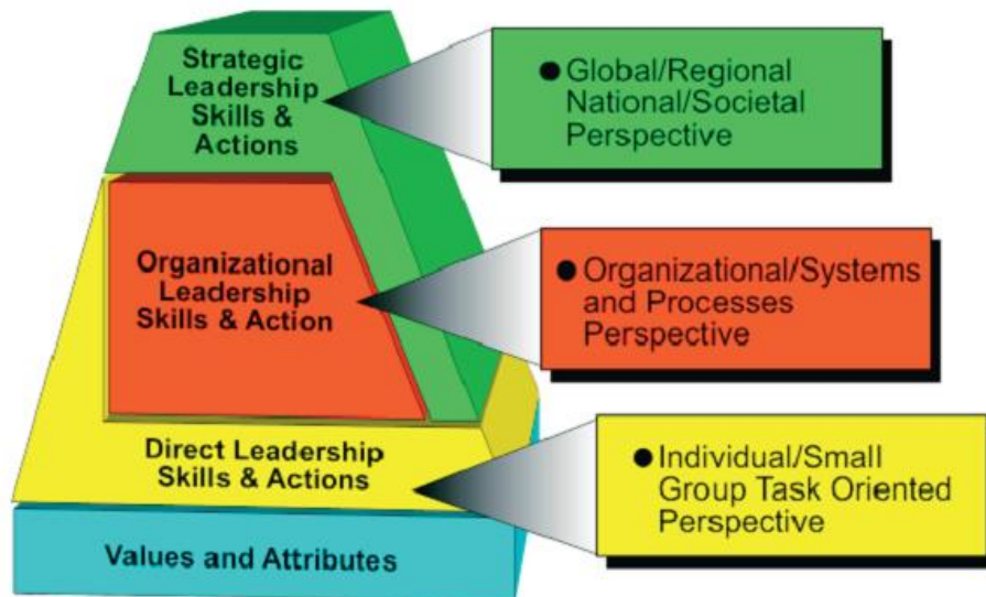
Figure 3. Modern approaches of Levels of Army Leadership

Army leadership positions divide into three levels—direct, organizational, and strategic. The leadership level involves a number of factors, including above figure. It is clear states that main regression is leadership factor among many variable which serves and promotes new solutions and development goals.