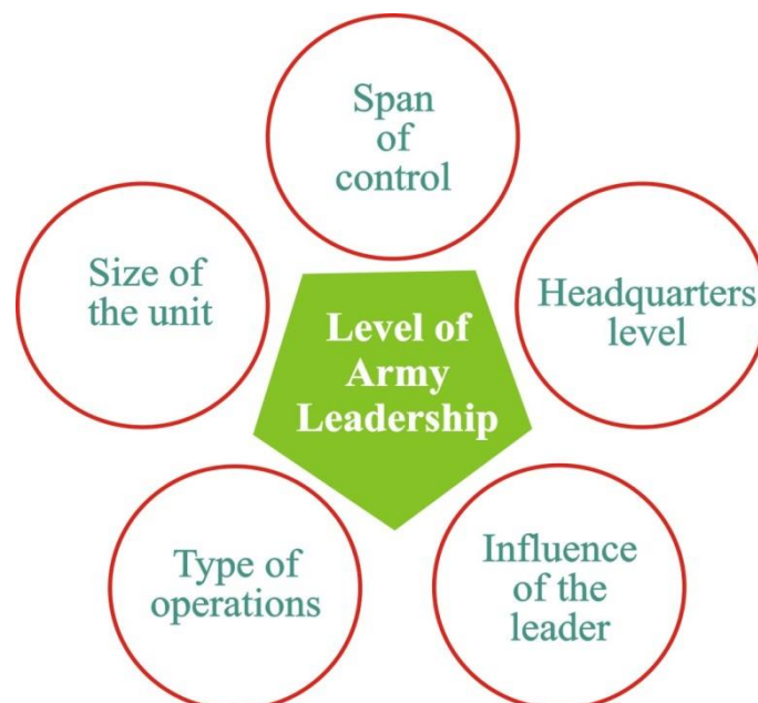
Figure 2. Innovative way of leadership level at Army

Best educational approach is every Friday of the week in the Armed Forces is marked as "Day of Spiritual Enlightenment and Patriotism", with special emphasis on spiritual and educational activities. In addition, according to the decision, the Ministry of Defense will introduce an additional training system for the commander-tactical education and ideological work on the basis of the general faculty of the Armed Forces Academy from 2018/2019 academic year. Within two months will develop the qualification requirements, curriculum and program for this specialty.