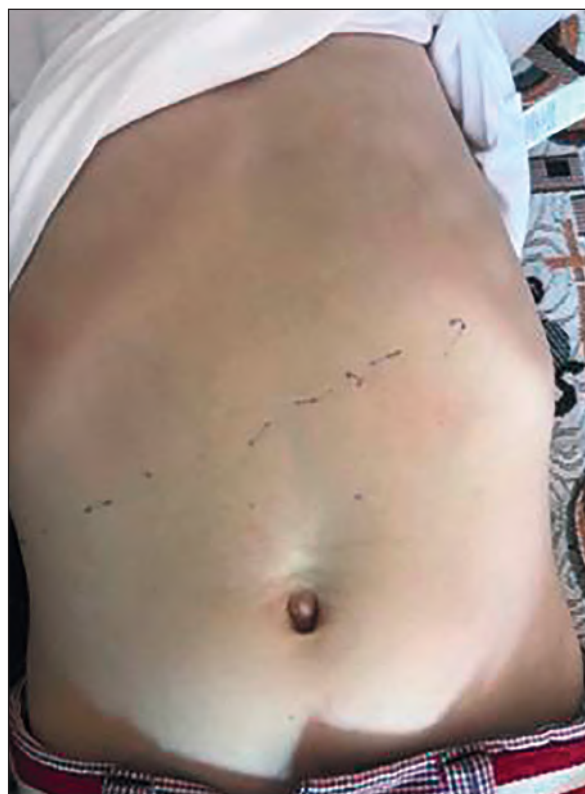
Figure 1. Picture of the abdomen (hepatomegaly is marked on the picture)

The gastroenterologist prescribed treatment with ursodeoxycholic acid 20 mg/kg/day and polyunsaturated fatty acids (omega 3) 800 mg/day. The rapid disease course, persistent hepatosplenomegaly, despite treatment with hepato-protectors, cholagogues and choleretics, changes of the lipid profile indicated a lipid metabolism disorder and gave rise to the suspicion of a rare genetic pathology. The child was referred to the Hepatology Centre of the "Institute of Paediatrics, Obstetrics and Gynaecology of the