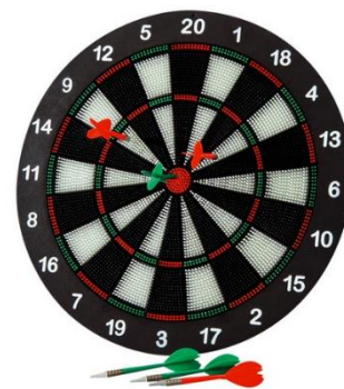
Figure. 1 Equipment of darts game

In this section, the potential of Darts game is