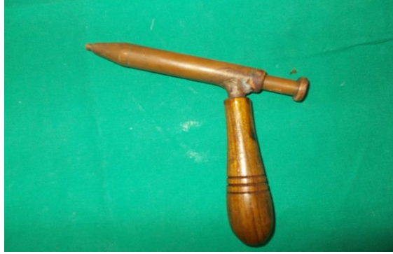
Fig 1 Instrument for Gudaagnikarma

• Instrumentation- Instrument was designed and developed with Copper having 13 cm length, 1.5cm Diameter and is having piston for expulsion of the heated guda (Figure No.1).