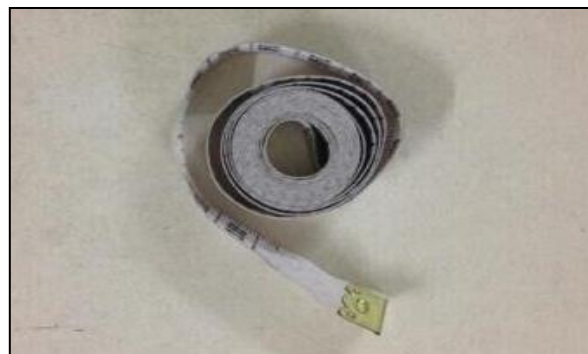
Fig. 4: Measuring tape