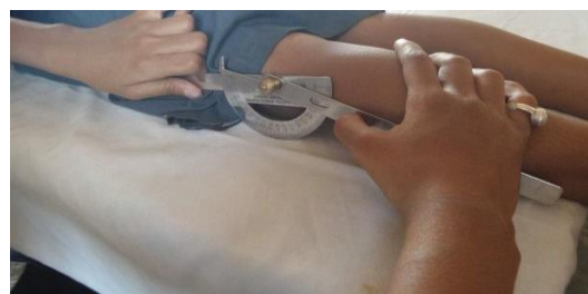
Fig. 11: Hyperextension of Knee