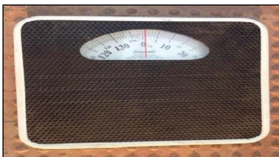
Fig. 1: Weighing machine

Materials Used: Weighing machine, Universal half-circle goniometer, Finger goniometer, Measuring tape, Ruler scale, Physical Activity Questionnaire for Children (PAQ-C) (Fig. 1-5).