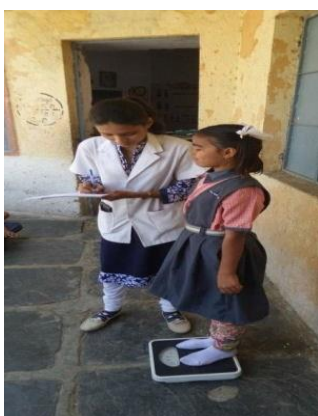
Fig. 7: Weight measurement