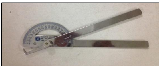
Fig. 2: Universal half circle goniometer