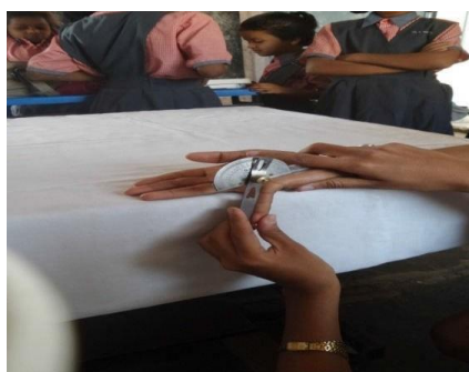
Fig. 9: Hyperextension of 5 th MCP