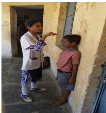
Fig. 6: Height measurement