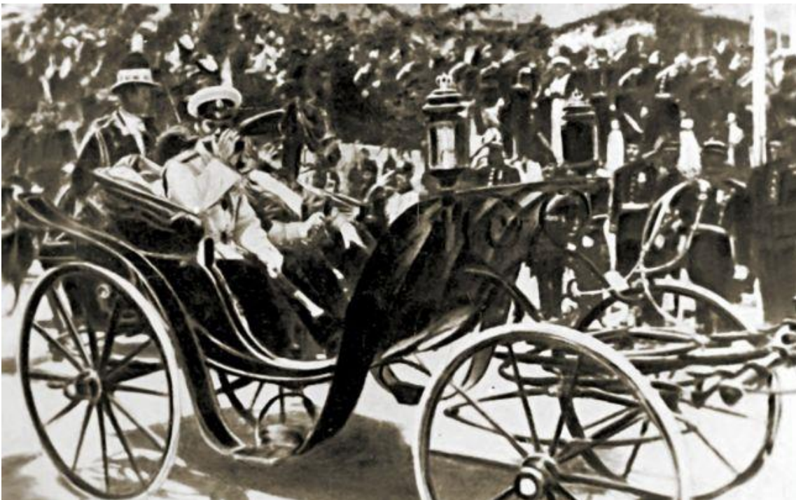
Fig. 3. Tsar Nicholas II and King Carol I saluting the crowds (Constantza, 1/14 June 1914)