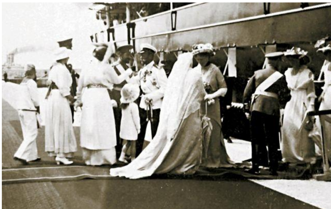
Fig. 1. Arrival of the tsar and the imperial family in the port of Constantza (1/14 June 1914)