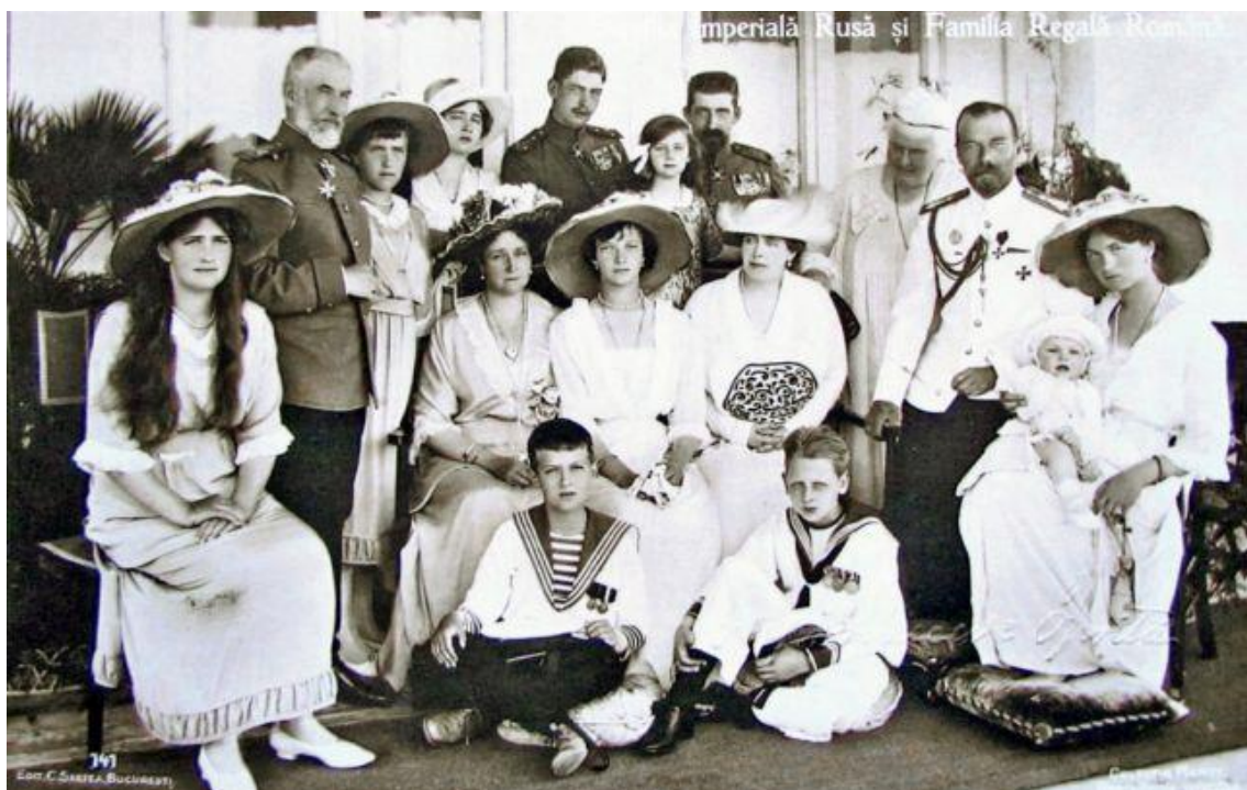
Fig. 4. Members of the Russian imperial family and members of the Romanian royal family (Constantza, 1/14 June 1914)