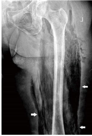
Figure 1. X-ray examination of the soft tissue of the left thigh with necrotizing fasciitis reveals the presence of gas (white arrows).

Abdomen examination did not reveal abdominal tenderness, defense or rebound. Laboratory test results on admission showed white blood cell (WBC) 12 000/ \mu L (3 700/ \mu L-10 000/ \mu L), hemoglobin 7 g/dL (10.8 g/dL-14.2 g/dL), C reactive protein (CRP) 34 mg/dL (<0.5 mg/dL), creatinine 1.44 mg/dL (0.50 mg/dL-0.90 mg/dL), glucose 65 mg/dL (74 mg/dL-106 mg/dL), sodium 142 mEq/L (136 mEq/L-145 mEq/L), albumin: 2.2 g/dL (3.5 g/dL-5.2 g/dL), lactate: 1.2 mmol/L (0.5 mmol/L-2.0 mmol/L). X-ray of the left