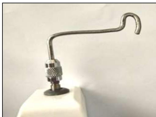
Fig. 4: Hook modification of push and pull gauge