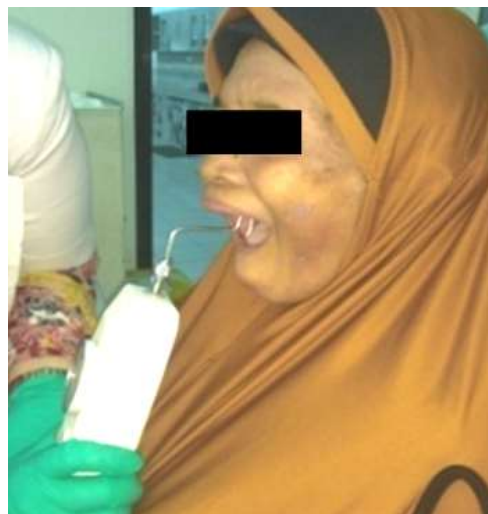
Fig. 5: Retention measurement

Data normality test was carried out using the Kolmogorov-Smirnov test and obtained a value of p \Rightarrow 0.05 , which means that the research data was normally distributed. From the results of the study it was found that in the anterior the largest value was found in group C which was 5.53 mm and the smallest value was in group D which was 2.61 mm. In the posterior area the largest value was found in group C which was 5.67 mm and the smallest value was in group B which was 3.21 mm. (Table 1). The highest retention measurements were found in the sample groups C and D that is equal to 54 N while the smallest value is obtained in the sample in groups A, D and B which is equal to 33 N. (Table 2)