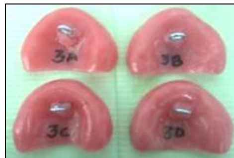
Fig. 2: Loop position on the impression tray

Border molding procedure was done with two techniques functional and manual. The procedure is: 1. Impression material material adhesive tray is applied to all peripheral parts of impression tray 2. The heavy body polyvinylsiloxane material is mixed with the automixing method using a dispensing gun (groups A and B), 3. The polyvinylsiloxane putty is mixed manual with base and catalys as much as 1: 1 (groups C and D), 4. Application of border molding material to the entire peripheral tray. 5. Patients are instructed to perform functional movements, which are: Smile, Grin, Call the letter O three times, than Move the jaw to the left and right, Open and close mouth, and perform a valsalva maneuver. The manual method done with the operator helps perform muscle activation movements, which: Emphasis on hamular notch, withdrawing the buccal muscles out and down three times, withdrawal of the labial muscle outward three times than Then the dentist Instruct the patient to do a valsalva maneuver (Fig. 3)