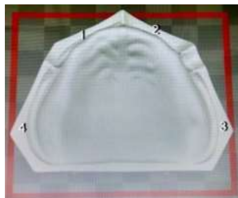
Fig. 6: Morphological detail measurement with CAD / CAM image