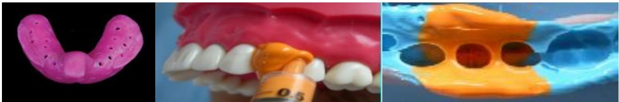
Fig. 1: Final putty impression

Procedure: There are three approaches for making impression including: The first approach is to fabricate a custom tray with poly methyl methacrylate materials or light-cure materials. One layer of base plate wax is adapted over the diagnostic cast as a spacer, and wax is removed from nonfunctioning cusps to provide occlusal stops. A putty impression is made in a stock tray that results in a PVS putty custom tray. Fig. 1