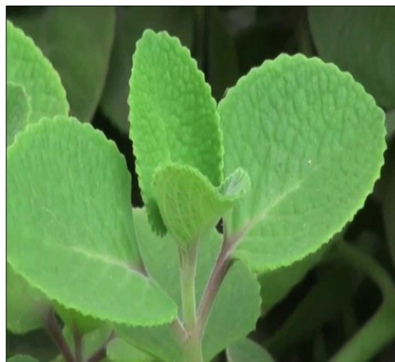
Fig 1 Plant material

under tap water to clean the soil adherence, later cleaned leaves were subjected to surface sterilization with 70% ethanol for about 30s, 5 minutes with 0.01% mercuric chloride, next with 3 minutes in 0.5% sodium hypochlorite, and lastly wash leaf material with distilled water.