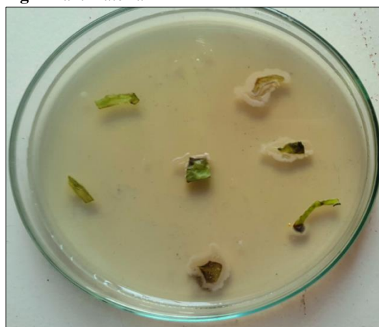
Fig 2 Sectioned leaf showing endophytic bacteria. Symptomless, disease-free leaves of the leaf were cleaned, blotted, and dried with clean blotter paper. After surface sterilization, the plant materials were sectioned into pieces of about 2-3 inches using a sterile scalpel. Sectioned plant material was placed at