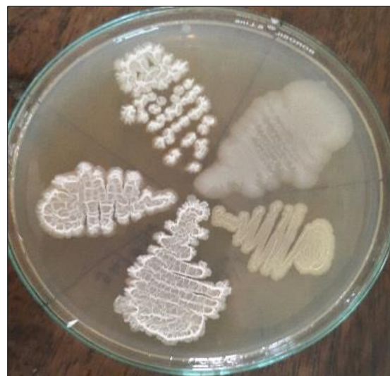
Fig 3 Sub-culturing of endophytic bacteria

endophytic bacteria isolated were did on the basis of grams staining technique (Table 1).