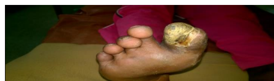
Fig 1 Before treatment ulcer of the patient

Gradually, he developed swelling and reddish discoloration on right great toe associated with blackish discoloration on fore foot. After a week, there was a crack on right toe and the nail was completely peeled off at night leaving an ulcer [Fig:1].