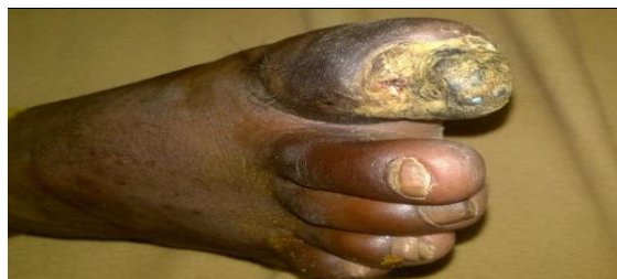
Fig 2 After treatment healed ulcer