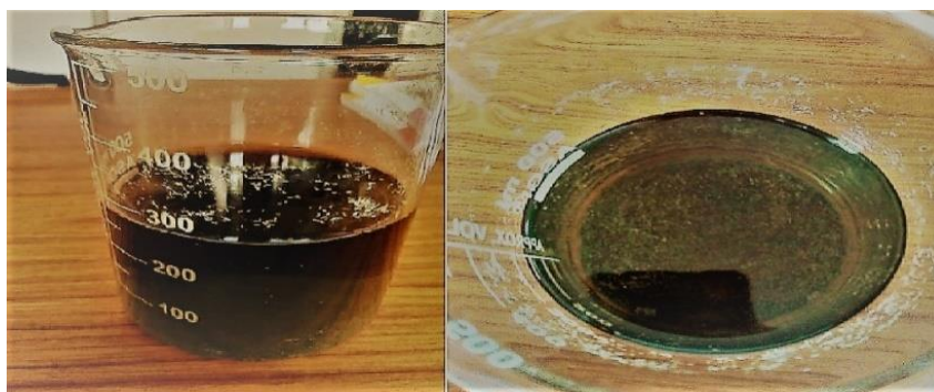
Fig. 1: Zinc-aspirin metal complex

The Pale yellow colour Zinc-aspirin compound had been synthesized having melting point of 112 - 116°C. (Fig. 1)