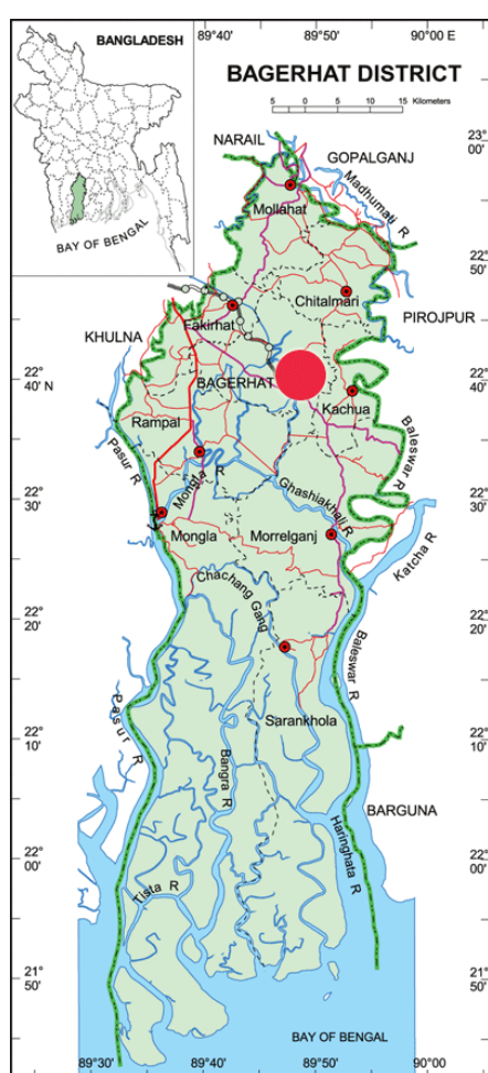
Figure 1: Map of Bagerhat district, Bangladesh, indicating the case study area by red circle

Study area and duration: The coastal area lies in the alluvial plains of Bangladesh between 89.00° E and 92.20° E in the northern and north-eastern part of the Bay of Bengal (Brown 1997). The study area, Bagerhat district is lies between 89°30" and 90°00" E. The case study was carried out in Bagerhat Sadar, a sub-district of Bagerhat district, a well-known shrimp and prawn production zone in the south-western part of Bangladesh (Figure 1). The total area of this district is 3959.11 km 2 and Bagerhat Sadar retains 272.73 km 2 and thus the study area covered 6.89% area of Bagerhat district and the duration of the study was March, 2012 to January, 2013.