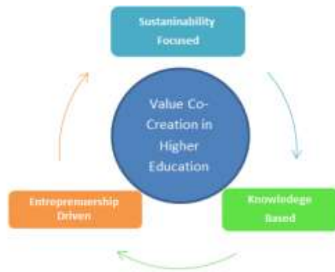
Figure 1: The HEI's centripetal position in Today's societal context (Khalid, 2016)