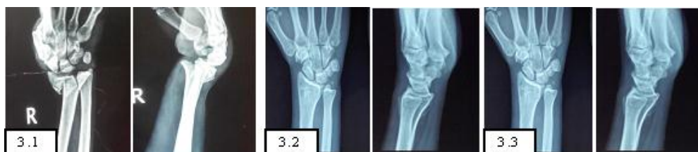
Fig 3.1: Preopxray