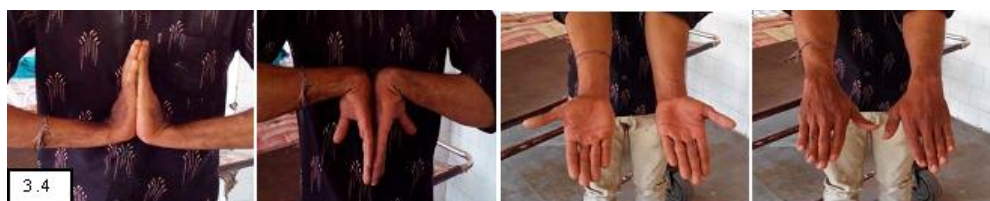
Fig 3.4: Clinical photographs