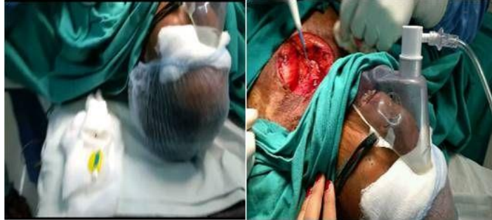
Fig. 2: Intraoperative Period

For the graft harvest, unilateral subarachnoid block was instituted with the patient in right lateral position with a 25 gauge spinal needle in L3-L4 space with hyperbaric inj Bupivacaine 0.5% 2 cc(10mg) and dermatomal block till T12 was achieved.