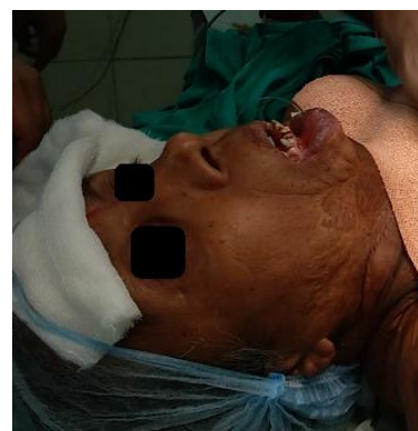
Fig. 1: Preanaesthetic airway evaluation

On examination, patient was conscious, cooperative and well oriented. General examination and systemic examination were normal. Spine examination revealed no abnormality. On airway examination, there was restricted neck extension; however mouth opening was two and half fingers and grade II under Mallampati Classification.