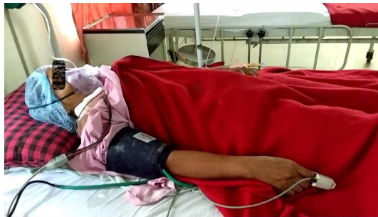
Fig. 3: Postoperative Period

Post-operatively in the recovery room, monitoring was continued and multimodal analgesia was maintained with epidural doses 0.125% 6cc with 30 mcg injection Norphine 6 hourly and Paracetamol infusion. Epidural catheter was removed after 72 hours.