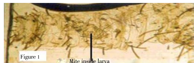
Figure 1. Mites predated larvae (inside the body).

The live predation of larvae by mites was observed under microscope attacking in mass and penetrating inside the larval body by scraping and eating the entire internal body parts (Figure 1). Bunch of nymphs and adults ( n=30-50 ) were found attacking the whole body of the larvae of sand flies from 2nd instar to 4th instar. Mites did not prefer the first instars and pupae. Mites initially scratched the exoskeleton of the larvae and entered inside the body followed by damaging whole internal organs resulting to the death of larvae. Many scars were observed on the body of larvae. The live scene was visualized under dissecting microscope and mounted the dead larvae along with mite inside the body in Canada balsam and photographed. These have infested all 50 rearing pots having 30–50 sand fly larvae each and brought down the adult emergence up to basal level within 15 d. Only 5% of the larvae could be able to reach up to adult stage. The result had shown the significant control of larval number. This may act as one of the control measures of sand fly larvae.