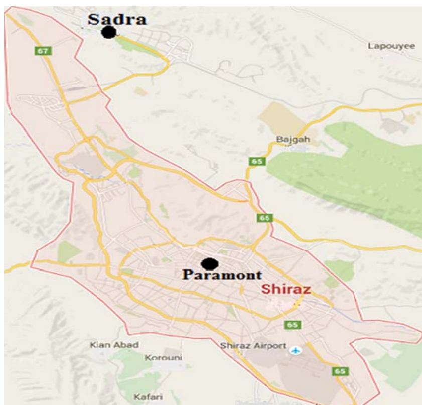
Fig.1. The map of the study area to show the two sampling sites

bath for 30 min. Then, the solvent mixture was passed through a PTFE syringe-filter (0.22 \mu\text{m} , 25 mm in diameters) to separate the suspended particles. The solution was dried using a stream of gentle purified nitrogen. Finally, 1 mL of the DCM/methanol mixture was added to each vial again and kept refrigerated in dark until analysis. Identification and quantification of 16 PAHs were performed using Gas Chromatography (GC) coupled with mass spectrometry and a DB-5MS capillary column (Agilent Co., USA) in Selected Ion Monitoring (SIM) mode. The characteristics of the GC/MS and the temperature program have been presented in Table 1.