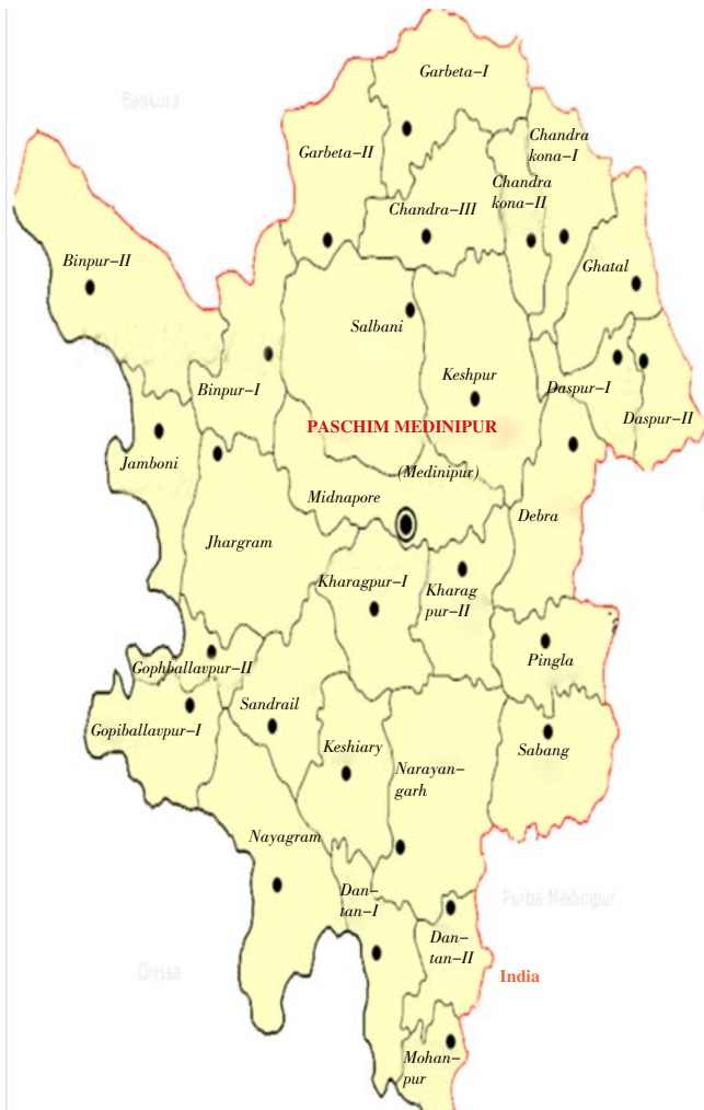
Figure 2. Paschim Medinipur district.

(Figure 2). North and Northwest of this district is a part of Chotanagpur plateau. The area has a gentle slope from east to west. The flora of this region is constituted predominantly with sal of coppice origin and covers 60% of the average area. The usual associates of sal in this region are Pterocarpus marsupium , Terminalia arjuna , Madhuca latifolia , Bombax ceiba , Terminalia belerica . Plantation mainly includes Eucalyptus , Akashmoni , Bamboo and Kaju . The tribal communities residing in this region are the Santhals , Mundas , Lodhas , Bhumijis , Oraon and Kherias . This region is characterized by sandy loam or loamy soil of reddish or reddish brown colour. The maximum temperature recorded in April is 45–46 °C and minimum temperature in winter is 6 °C. The average annual rainfall is about 1500 mm. The present work makes an attempt to provide a comprehensive account of some of the Indian medicinal plants used in the treatment of snake bite in Paschim Medinipur district of West Bengal by the tribal communities and traditional healers.