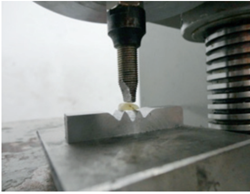
Figure 1. Three-point bending test using Universal testing Machine.